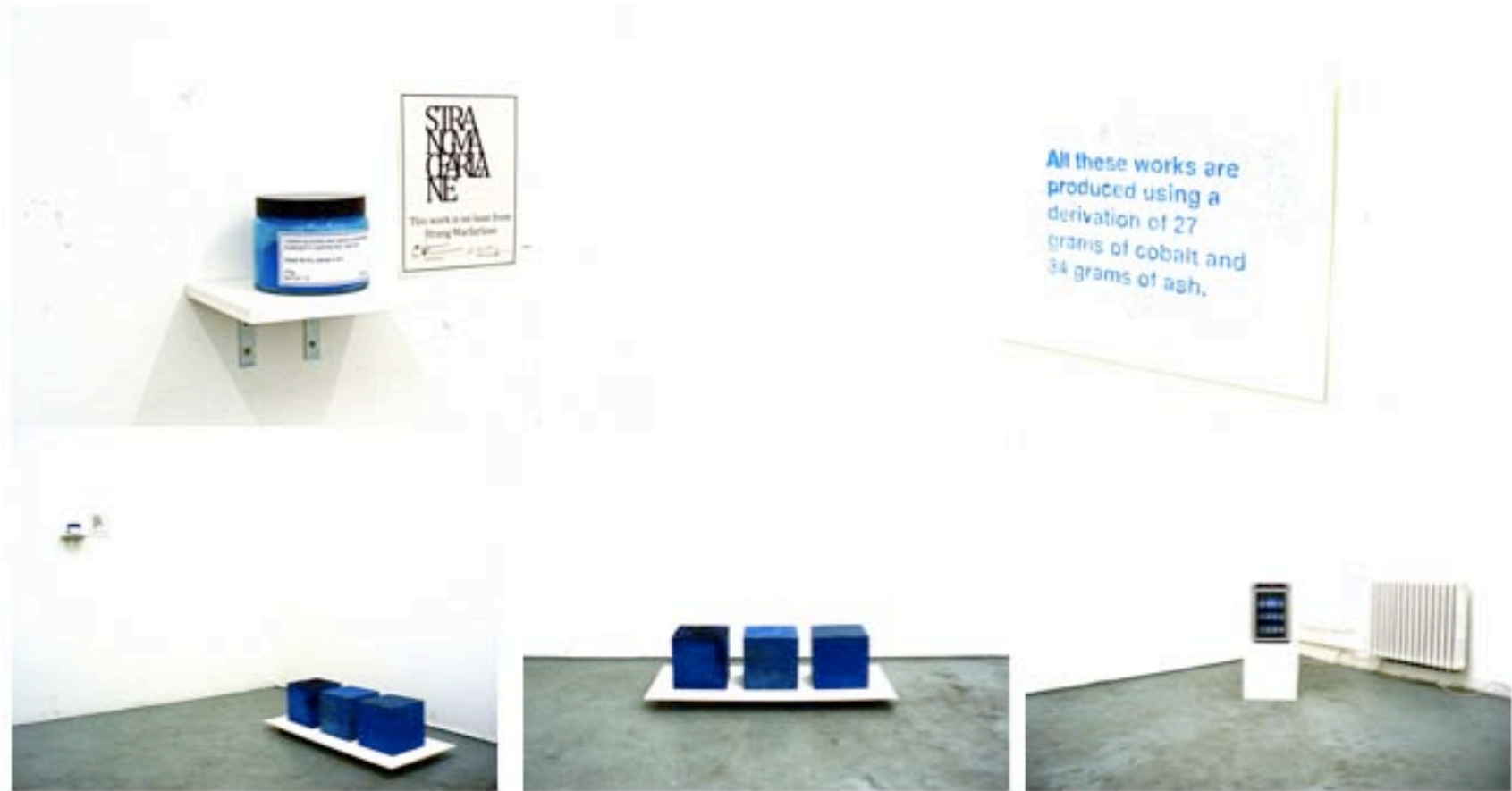
CURIOSITY CASTRATED THE CAT / INSTALLATION; TOWER BLOCKS AND MARILYN MONROE (2009), PERFECT CUBE 27 v.1/2/3 (2009-10), LET'S ALL SACRIFICE MARILYN MONROE (2010)

all these works are made using a derivation of 27 grams of cobalt and 34 grams of ash. (February 2010)