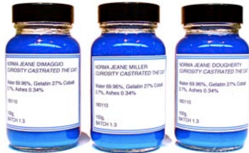
NORMA JEANE DIMAGGIO / NORMA JEANE MILLER / NORMA JEANE DOUGHERTY / BATCH 1.3 CURIOSITY CASTRATED THE CAT water, gelatin, 27g cobalt, 0.34g ashes, glass container (January 2010)